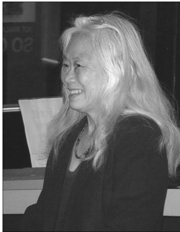
Maxine Hong Kingston

To explore how language links to various groups or societies in a text, let’s return to A Raisin in the Sun . Within the family, no two characters use language the same way; Mama, Beneatha, and Walter offer the most startling contrasts. Hansberry goes to great lengths to describe her characters’ language. Mama, from the South, “is inclined to slur everything” (Hansberry 39). In contrast, her daughter Beneatha’s speech “is different from the rest of the family’s insofar as education has permeated her sense of English” (35). Beneatha’s world of education has encouraged her standardized English usage. Finally, Walter, the son striving to achieve his dream, has a “quality of indictment” in his voice (25). Hansberry evokes her characters’ lives through their language use. Although in the same family, their societies differ; therefore, their language differs.